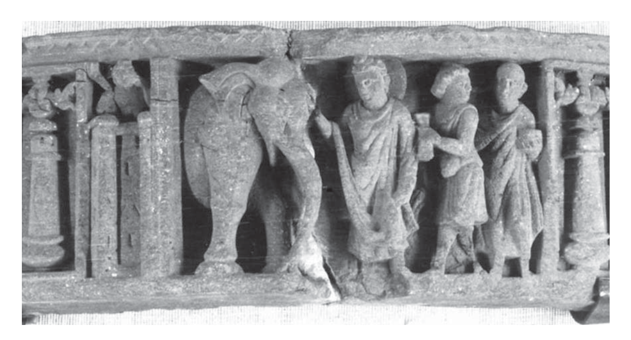
FIGURE 2: GANDHARA (CHATPAT), CHAKDARA MUSEUM, 134, PHOTO © WOJTEK OCZKOWSKI.

conversion of nāga Apalāla (for summaries and analyses of texts and the list of known depictions of Zin 2006: ch 3). The story is related to the series of conversions in Gandhara, during which the Buddha managed to convert 7, 700,000 beings. The Buddha's journey to Gandhara, accompanied by Vajrapāṇi, is described in the Mūlasarvāstivādavinaya. This is preserved in the Gilgit Manuscripts as well as in Tibetan and Chinese translations (trad in: Przyluski 1914). Five conversions are described here in detail, among them the taming of the malevolent nāga Apalāla. The king of Magadha Ajātaśatru asks the Buddha to tame this nāga, who damages crops by sending bad weather. The Buddha, accompanied by Vajrapāṇi, goes to Gandhara to deal with this problem. Apalāla becomes furious, rises into the air and continuously flings hail and pieces of ground at them. The Buddha enters into the meditation of love (maitrisamādhi), as a result of which hail and pieces of ground turn into sandal and other fragrances. The nāga