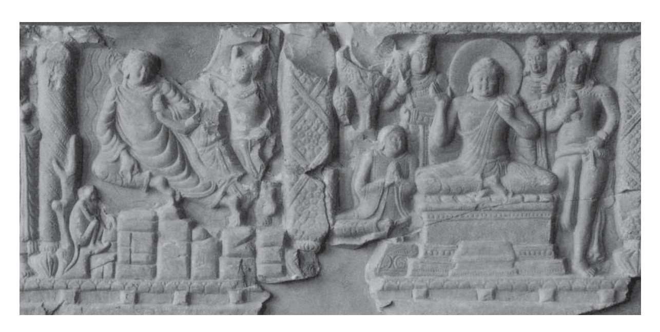
FIGURE 1: GOLI, NEW YORK, METROPOLITAN MUSEUM OF ART, NO 30.29, AFTER RAO 1984: 435-39.