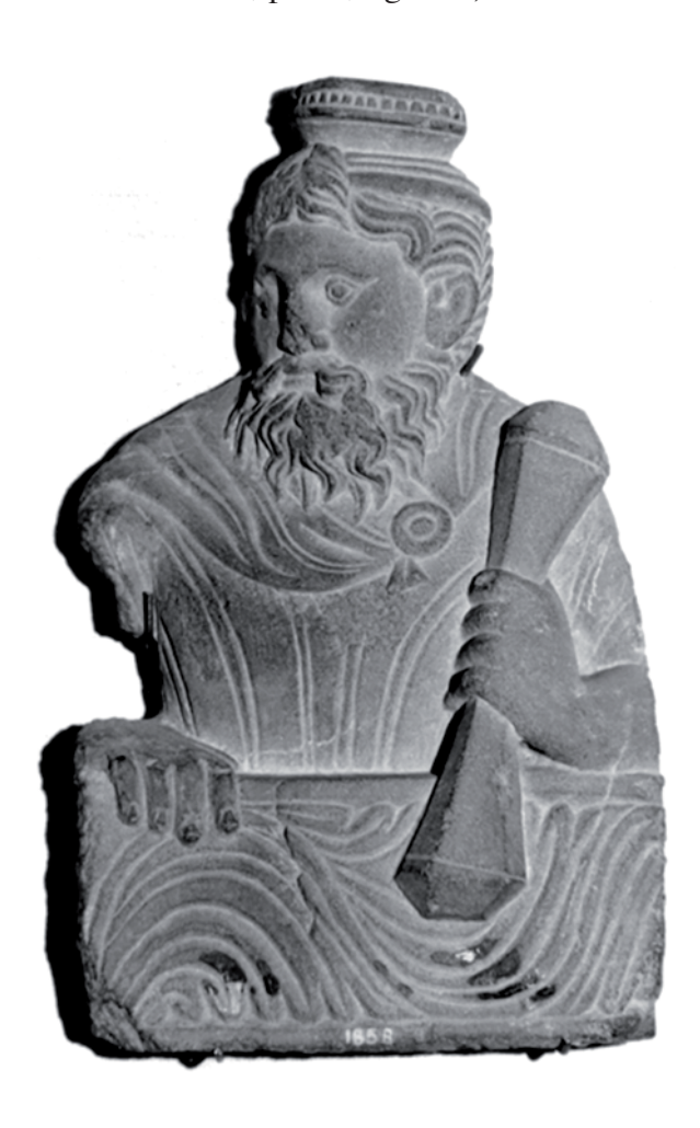
FIGURE 10: GANDHARA PESHAWAR MU-SEUM, NO 1858, PHOTO © WOJTEK OCZKOWSKI.

Precious stones were presented as crystals in art. They may be observed in the example of depictions of the cakravartin king. In Amaravati, Mathura, Gandhara and Central Asia, his maniratna has the shape of a crystal with at least four walls with clearly marked edges (Zin 2003: 357, for Mathura Sanghol: Gupta 1987, figure 15; for Gandhara: Nishoika 2001, plate 1; Gandhara 2009, p.311, figure 6). From the stone, rays or flames often flare out. The similarity