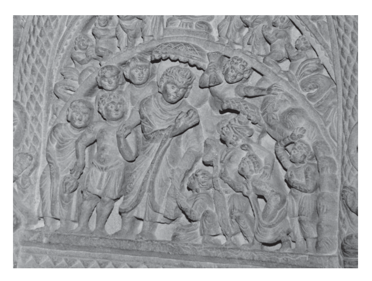
FIGURE 3: GANDHARA, PESHAWAR MUSEUM, NO 336 N.N. 98.

In the scenes of the conversion of Apalāla found in Gandhara, Vajrapāṇi is frequently depicted in two different ways. In one, he is positioned near the Buddha with the vajra in his left hand. In the other, he has the weapon lifted up in his right hand and, hanging out of the rocks, he threatens the terrified family of Apalāla (Figure 3; in especially elaborate reliefs, the artists depicted the landscape with animals and a hunter [cf a relief from Barikot in Swat, ill: Kurita 2003 vol 1 figure 637]). Vajrapāṇi is quite often shown flying (Figure 4). In several reliefs, like in one from Sanghao Vajrapāṇi jumps from one rock to another while the nāgas flee the lake whose