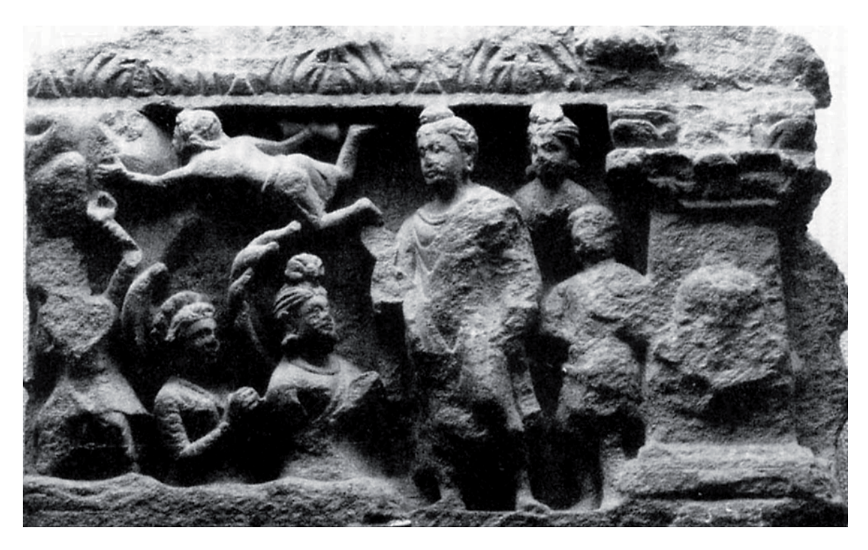
FIGURE 4: GANDHARA, PESHAWAR MUSEUM, NO 428 N.N. 95, PHOTO © WOJTEK OCZKOWSKI.

The story of the conversion of Apalāla is also depicted in Nagarjunikonda (ill: Rosen Stone 1994, figure 211, 218-20). It is shown in three very similar reliefs. As with the journey of the