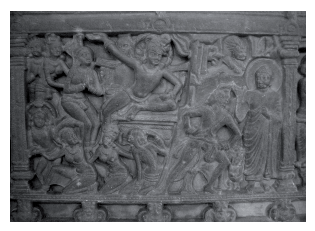
FIGURE 5: NAGARJUNIKONDA, NAGARJUNIKONDA MUSEUM, PHOTO © MONIKA ZIN.