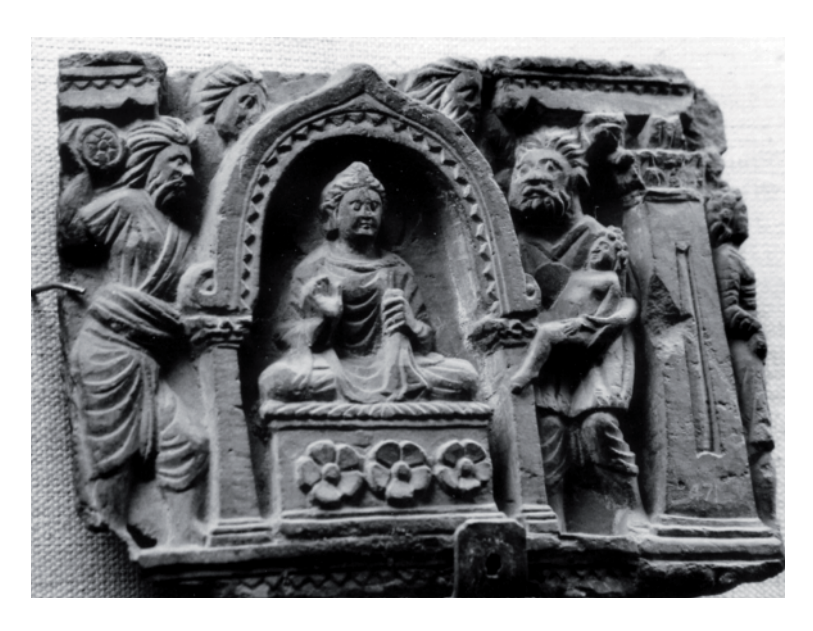
FIGURE 7: GANDHARA (SAHRI BAHLOL), PESHAWAR MUSEUM, NO 471, PHOTO © WOJTEK OCZKOWSKI.

in his right hand. In my opinion, this is Vajrapāṇi with the vajra, shown from an extremely untypical perspective, that is, from the bottom. The vajra is depicted in this way very rarely: one instance of this perspective is found in the beautiful relief in the Victoria and Albert Museum (no IS 78-1948, ill: Ackermann 1975, plate 35; Kurita 2003 vol 1 figure 374). This shows two scenes: the conversion of Nanda and the conversion of the heretic Śrīgupta.