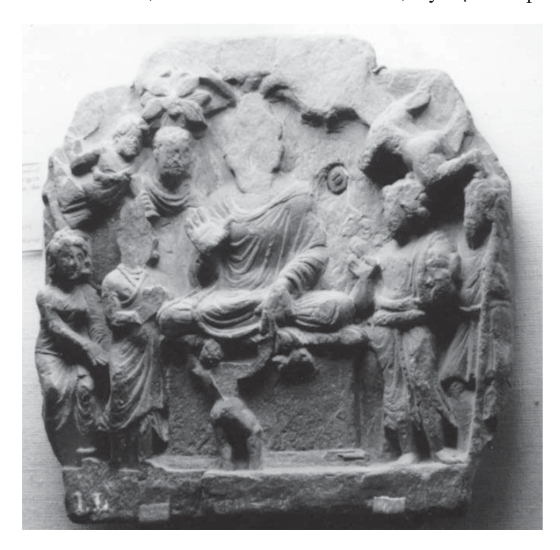
FIGURE 6: GANDHARA, PESHAWAR MUSEUM, NO 1.L, PHOTO © WOJTEK OCZKOWSKI.

Āṭavika and Vajrapāṇi which is not described in any of the preserved texts. Other reliefs depict the scene going on over people's heads. In a relief from Calcutta it is possible to identify the person throwing the stone, despite a poor state of preservation of this piece – this is Āṭavika (relief from Jamalgarhi, Indian Museum, no G 21 (A23284) ill: Foucher 1905-51 vol 1 figure 253; Kurita 2003 vol 1 figure 345). The assault of Vajrapāṇi on Āṭavika also seems to be depicted in one relief in the Peshawar Museum (Figure 7). On the right-hand side, Āṭavika is bringing a boy to the Buddha, while on the left-hand side, a yaksa-like person holds an unusual round object