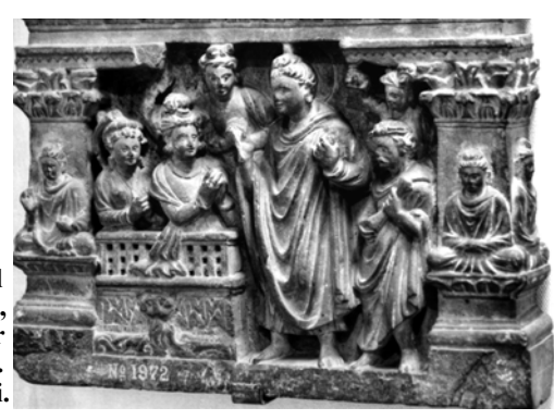
Plate 2.13: Buddha and Nāgarāja Kālika, Gandhara, Peshawar Museum, no. 1972.