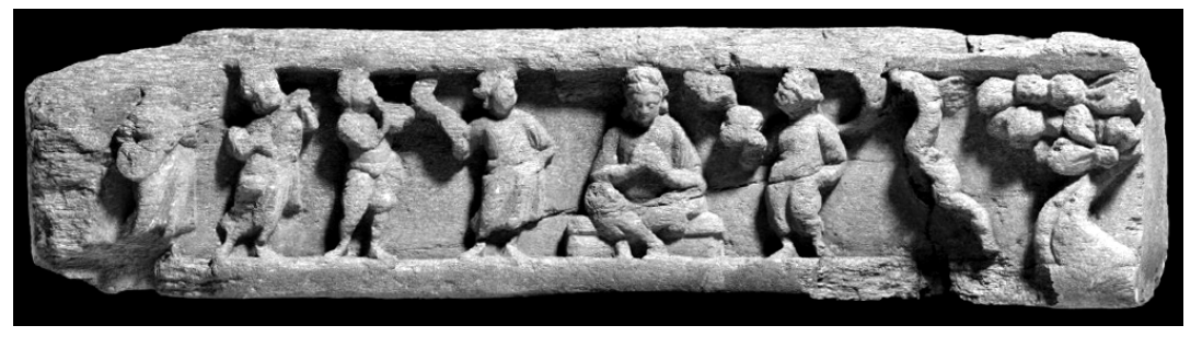
Plate 2.7: Stone No. 5 from the Water Tank, see Plate 2.2.