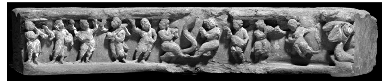
Plate 2.4: Stone No. 2 from the Water Tank, see Plate 2.2.