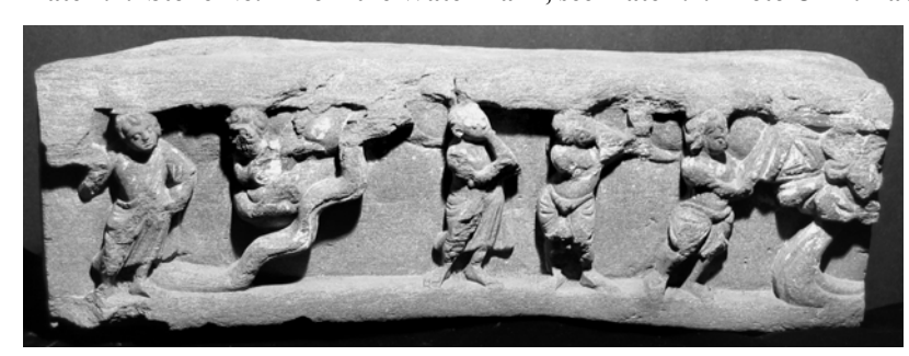
Plate 2.5: Stone No. 3 from the Water Tank, see Plate 2.2.