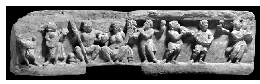
Plate 2.8: Stone No. 6 from the Water Tank, see Plate 2.2.