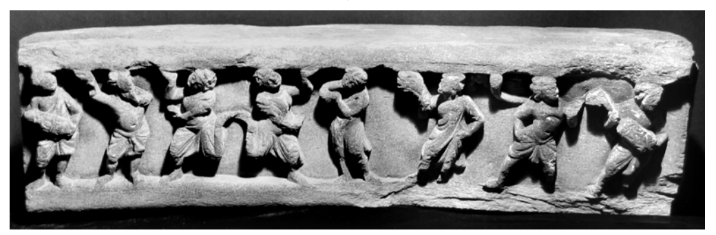
Plate 2.11: Stone No. 9 from the Water Tank, see Plate 2.2.