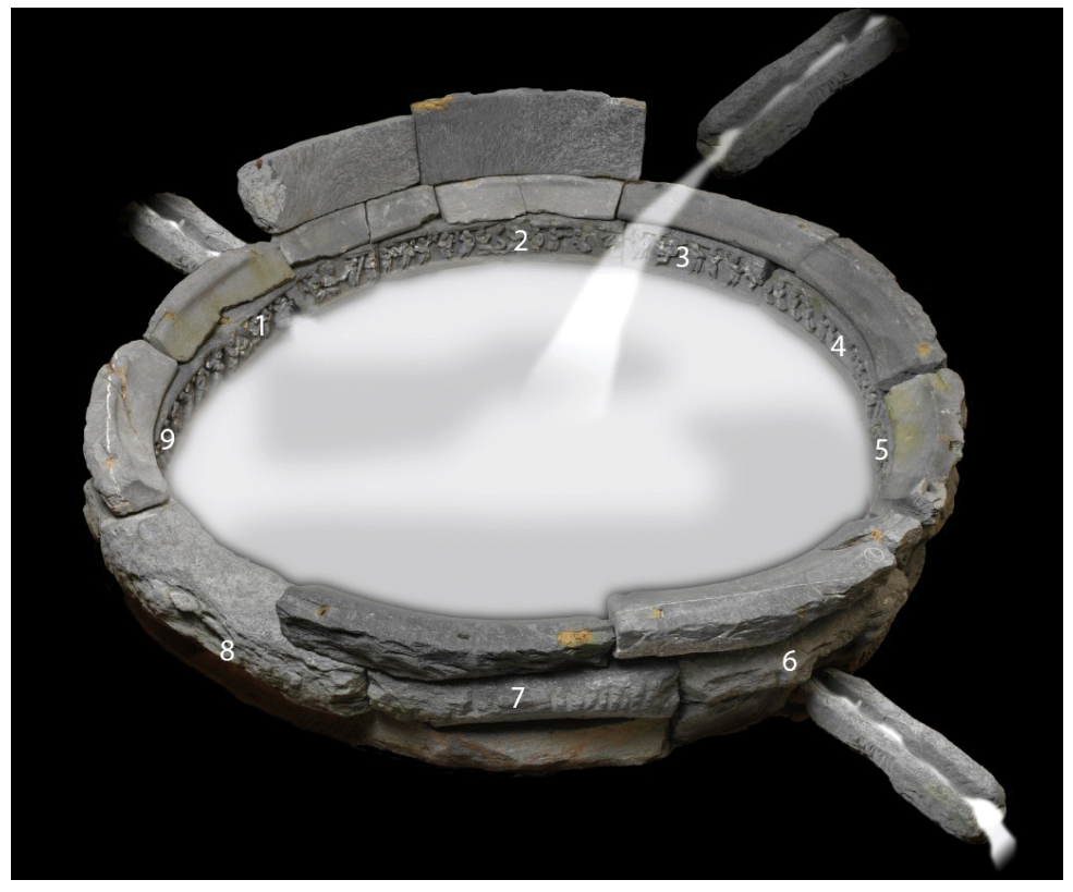
Plate 2.2: Water Tank, Computer-generated reconstruction, © Dominik Oczkowski.