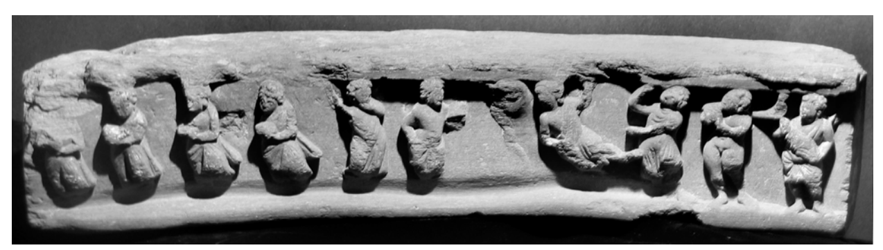
Plate 2.6: Stone No. 4 from the Water Tank, see Plate 2.2.