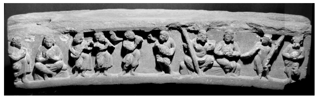
Plate 2.3: Stone No. 1 from the Water Tank, see Plate 2.2.