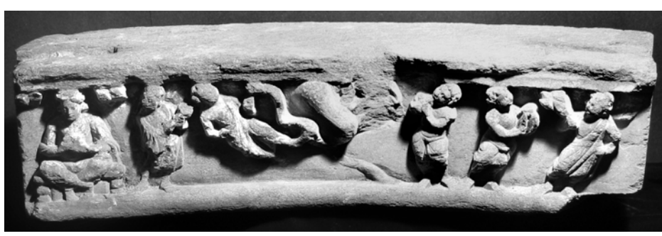
Plate 2.9: Stone No. 7 from the Water Tank, see Plate 2.2.