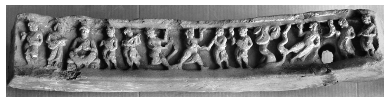
Plate 2.10: Stone No. 8 from the Water Tank, see Plate 2.2.